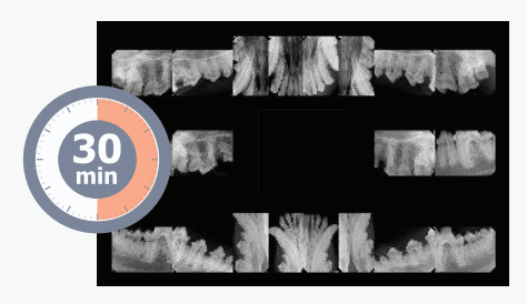
30 min. for traditional FMX